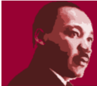
Dr. Martin Luther King Jr.