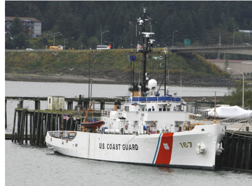
USCG Cutter Acushnet (WMEC 167)

KODIAK, Alaska - The Coast Guard cutter Acushnet is returning to service in the Bering Sea.