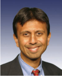
Governor Bobby Jindal