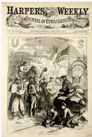
Thomas Nast's Original Civil War "Santa Claus In Camp", Harper's Weekly , January 3, 1863